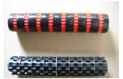
2 metering units for small or big seeds