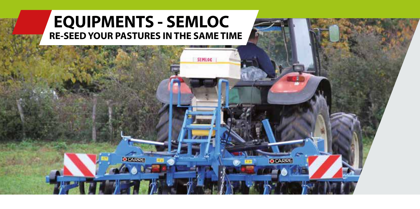
200 or 400L Tank with splines distribution, driven by mechanical rate governor wheel, allow dosing between 2 to 100 Kg/Ha Distribution fan driven by 2 electric motors